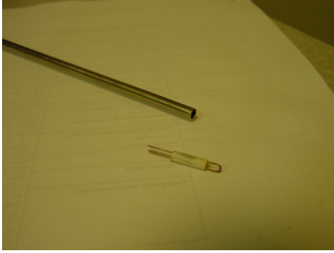
Fig. 1: Shorting Probe

The picture below shows the shorting probe: