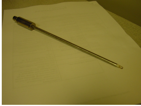
Fig. 2: Shorting Probe Installed

The shorting probe is used to determine the cable resistance.