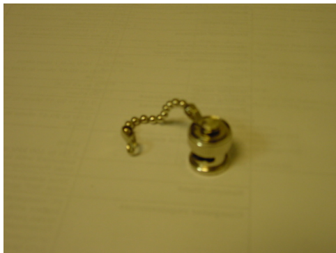
Fig. 1: Shorting Cap

The following photo shows a picture of the Shorting Cap: