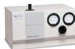
3302A Aerosol Diluter

A sampling probe designed to allow low-flow isokinetic sampling to the Laser Aerosol Spectrometer is inserted in a modified, Swagelok fitting which couples to the 3302A outlet. Critical orifices protected by a filter and an external pump (not supplied) are used to pull an auxiliary flow which will maintain a flow of 5 L/min through 3302A, while maintaining the necessary sample flow for the 3340 LAS.