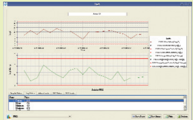
Example of SPC charts in FMS 5.0

For electronics, semiconductor, hard disk drive, and other applications, FMS 5.0 assists in maintaining contamination control of critical manufacturing processes. FMS 5.0 comes with built-in Statistical Process Control (SPC) tools. SPC parameters can be defined for Upper Control Limits, Lower Control Limits, mean crowding, alarm number, and trend number. Control charts can be generated by utilizing FMS 5.0's graphing function, and can aid in providing proactive predictive alarms to help alleviate issues before they arise. For defined sample points, detailed SPC information is displayed when accessed via the statistics function. FMS 5.0 provides a complete, statistical monitoring system with the data integrity needed to ensure optimal facility output.