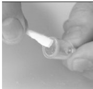
Figure 4. Cleaning Lamp Window

Ensure the lamp is completely dry and any visible signs of contamination are removed before replacing.