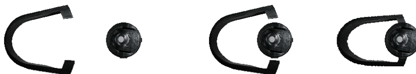
Figure 2. Using Electrode Stack Removal Tool.