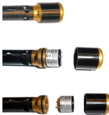
Figure 1. Removing cap and PID sensor from VOC probe.