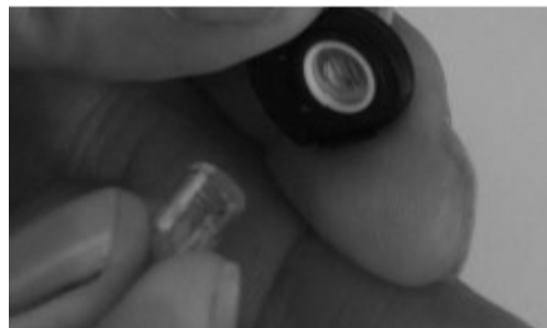
Figure 5. Inserting lamp into electrode stack