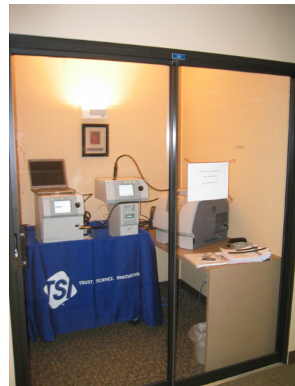
Figure 1: Phone booth office showing laser printer and measuring instruments